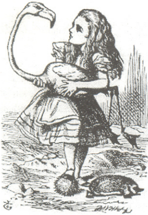
Alice in Wonderland