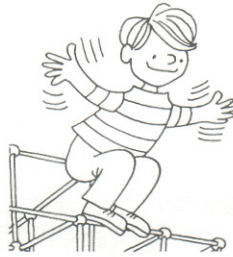
Tales of a Fourth Grade Nothing