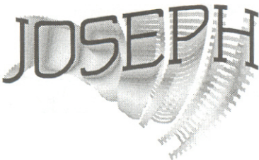
and the Amazing Technicolor Dreamcoat